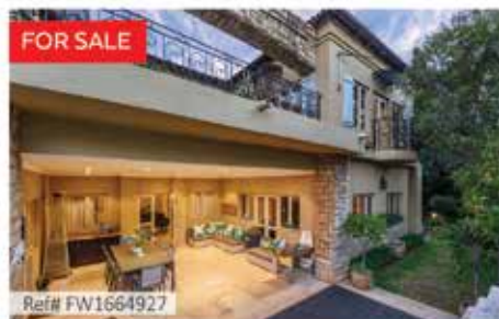
Dainfern Golf Estate • R5.5 million 4 Beds | 3.5 Baths | 2 Garages