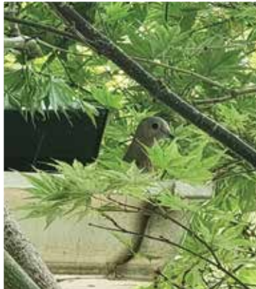
Far left:

In Johannesburg, summers can be hot and dry, while winters are cooler, with occasional frost. Make sure that the garden offers year-round resources. During the dry months, birdbaths and additional feeding stations become crucial.