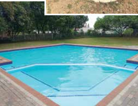
New clubhouse pool

This year also saw improvements to our facilities, including the repairs and resurfacing of the clubhouse pool which now includes a small section for younger swimmers and ongoing work at the pavilion pool. The clubhouse playground received new flooring, and quotes are being procured for additional shading to enhance the area.