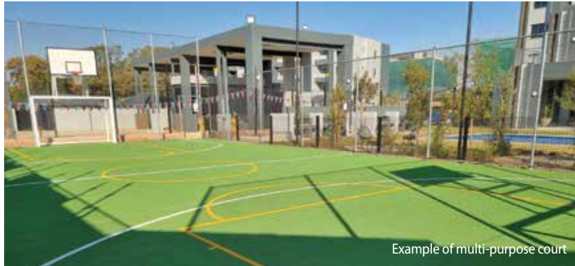
Example of multi-purpose court

Additionally, we're thrilled to introduce a multi-purpose court at the pavilion, which will accommodate basketball, five-a-side soccer, and pickleball—a great new lifestyle offering.