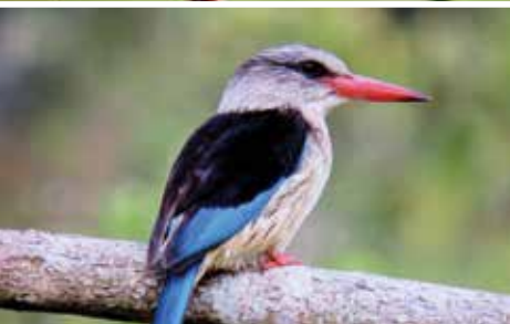
Top: Malachite Kingfisher Above: Woodland Kingfisher