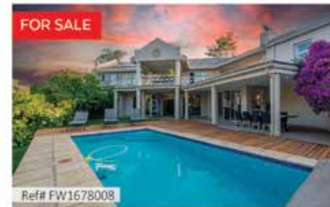
Dainfern Golf Estate • R6.95 million 6 Beds | 4.5 Baths | 2 Garages