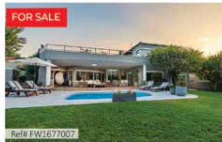
Dainfern Golf Estate • R10.95 million 6 Beds | 5.5 Baths | 3 Garages