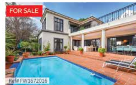
Dainfern Golf Estate • R5.5 million 4 Beds | 2.5 Baths | 2 Garages

PLEASE SCAN OUR QR CODES TO VIEW: Our Agent Profiles, Sold Properties, Current Listings On The Market & To Request An Evaluation