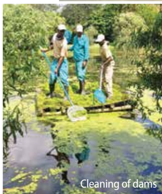
Cleaning of dams