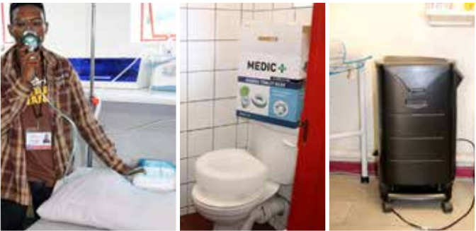
Above left to right: The nebuliser we donated to the ER in Witkoppen Clinic / Medical toilet seat / The air filters we took to Witkoppen Clinic for their TB room.

Sadly, for a lot of communities, winter brings with it the tragedy of shack fires, in which owners lose absolutely everything they possess. Having already assisted 11 families in Diepsloot when their dwellings were razed in mid-September, we were alerted to – and assisted with – seven more shack-fire cases. Thankfully, we were able to provide 4 utility tubs each filled with 30kg food, duvets, kitchenware, clothing and some toiletries, with thanks to several thoughtful Dainfern residents.