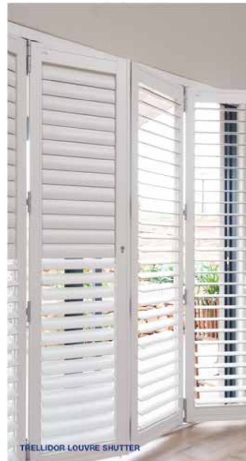
TRELLIDOR LOUVRE SHUTTER