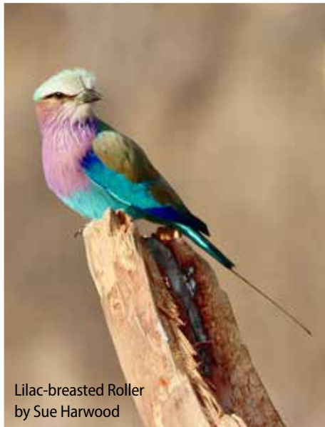
Lilac-breasted Roller by Sue Harwood

Saturday, 23 November 2024 at 06:45 for 07:00