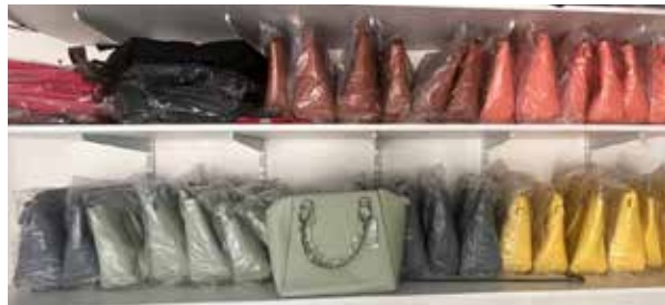
30 new handbags from CDP Gifts for our Bags of ♥ Dignity projects.