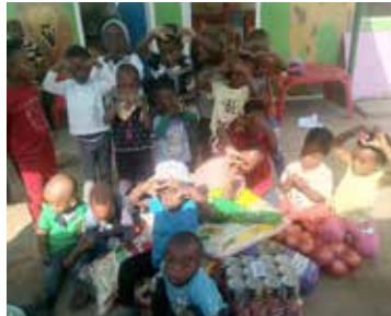
Monthly Groceries for the children at MaLizzy Pre-School.