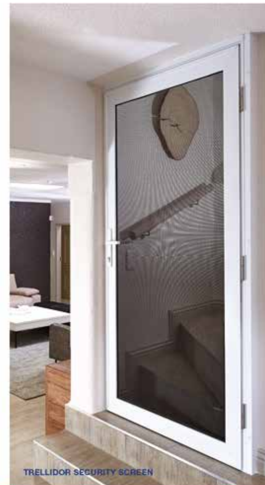
TRELLIDOR SECURITY SCREEN