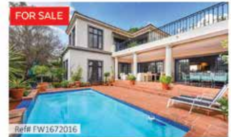
Dainfern Golf Estate • R5.5 million