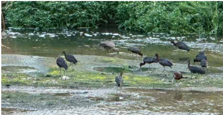
Glossy Ibis spotted in the Jukskei river on the estate

The glossy ibis ( Plegadis falcinellus ) is a striking bird found in various wetland habitats across South Africa. Known for its iridescent plumage that shimmers in shades of green and purple, the glossy ibis often feeds in shallow waters, searching for insects, crustaceans, and other small invertebrates.