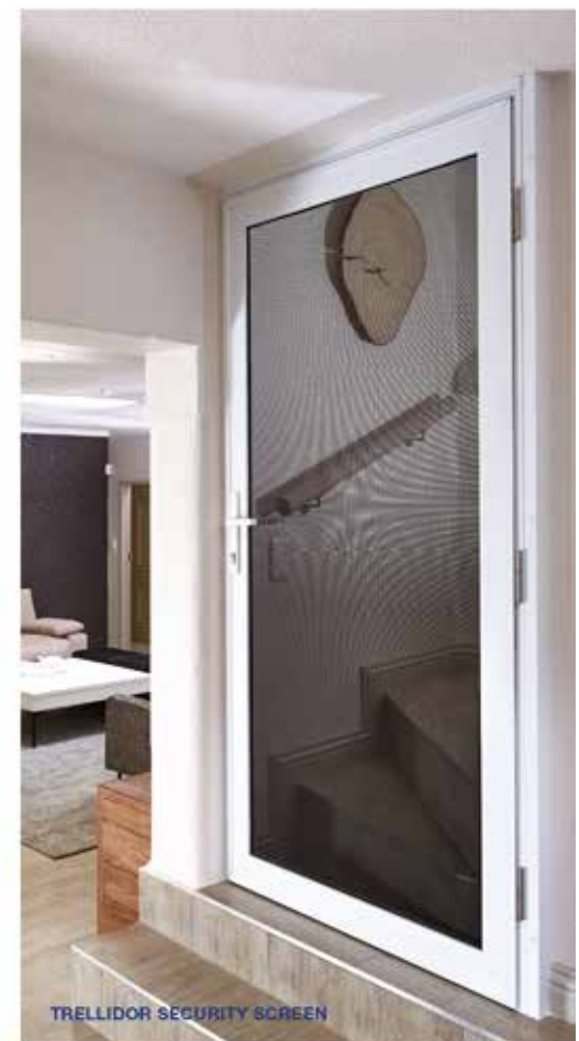
TRELLIDOR SECURITY SCREEN