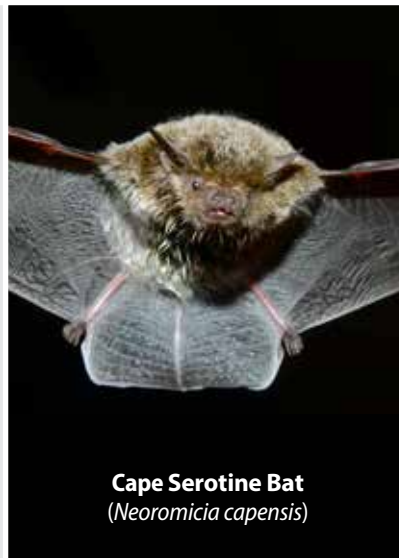
Cape Serotine Bat ( Neoromicia capensis )

Spooky bats like to sleep in the day. They hang upside down and doze that way! Caves and trees are where they stay. Until it grows dark - then it's up and away.