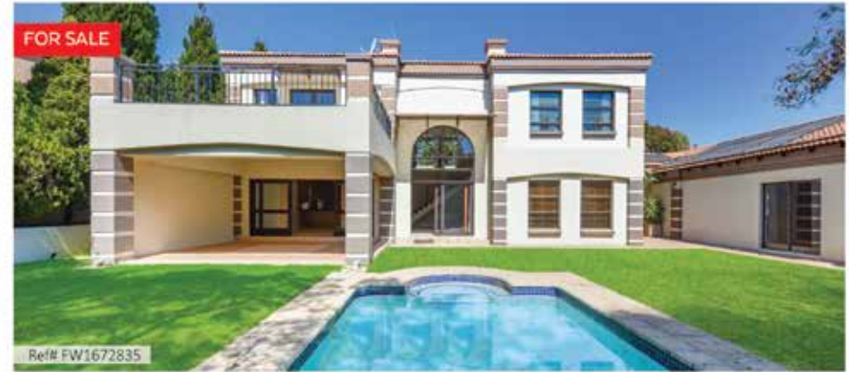
Dainfern Golf Estate • R6.9 million