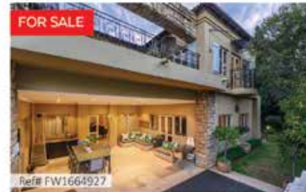
Dainfern Golf Estate • R5.85 million