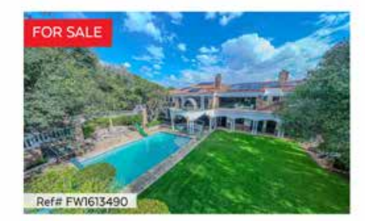
Dainfern Golf Estate + R19.5 million 5 Beds | 5 Baths | 6 Garages