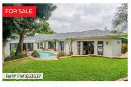
Dainfern Golf Estate • R5.1 million 4 Beds | 2 Baths | 2 Garages