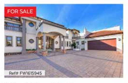
Dainfern Golf Estate • R9.95 million 4 Beds | 4.5 Baths | 4 Garages