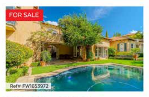
Dainfern Golf Estate • R7.95 million 3 Beds | 3.5 Baths | 2 Garages