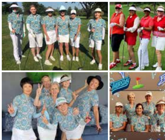
Top left to right: The Team who played at Bryanston Club; Valentine's Day game. / Above left to right: The Team who played at CC; League team that won at Kyalami.

With the COVID pandemic, unfortunately, no spectators will be allowed as per Government regulations. As we are a Residential Estate - we ask that you remain mindful of the golfers while out for a walk or run. Tee times will be from 06h15 onwards.