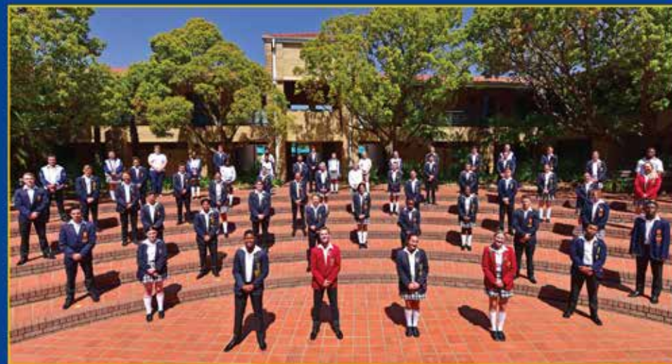
The Dainfern College Class of 2020

Since inception in 1997, the College has offered the IEB National Senior Certificate ('Matric') as its exit examination, and the first Grade 12 cohort wrote Matric in 2001. As Dainfern College is a member of the international Round Square association of schools, internationalism is one of its key drivers. Thus, in 2019, the College added Cambridge Assessment International Education to its academic offering with the introduction of the Cambridge A Level programme as an optional exit examination in Grade 12.