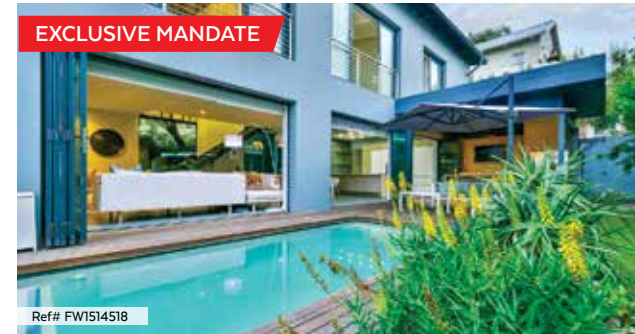
Helderfontein · R7.5 million

Fourways Sales Office +27 (0)11 467 4119 fourways@pamgolding.co.za