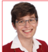
Ludwig de Ruyter