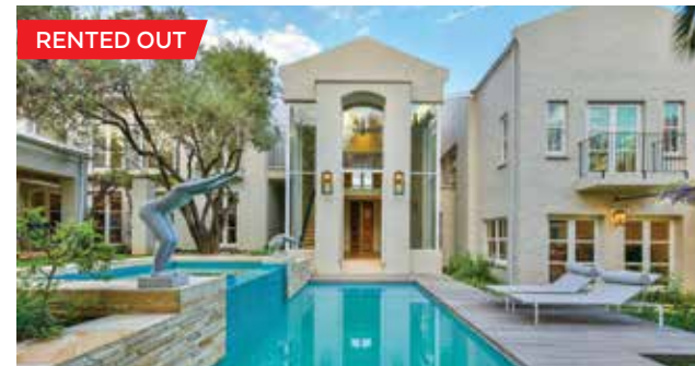
Dainfern Golf Estate · R 72 000 per month